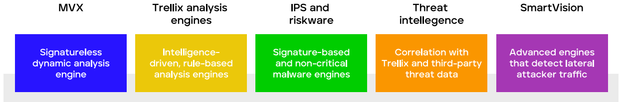
Figure 3. Modular components of Network Security

The MVX Smart Grid and Trellix Cloud MVX scalable architecture allow the MVX service to support one Network Smart Node to thousands and scale seamlessly as needed.